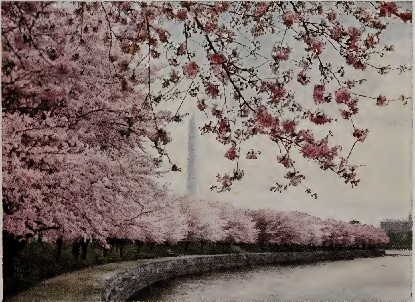
Japanese Flowering Cherry Trees

Mountain-Ash, European. A most satisfactory and handsome ornamental tree, with fern-like foliage and very large clusters of dark red berries in late summer and winter. Medium grower. Unusually ornamental and, without doubt, one of our very finest shade trees for all purposes. 5 to 6 ft., $1.00 each; 6 to 8 ft., $1.75; 8 to 10 ft., $2.75.